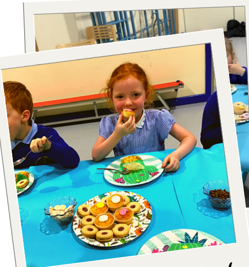
Autumn Term Tea Party