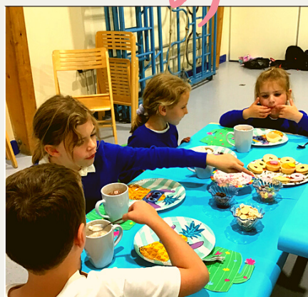
Autumn Term Tea Party