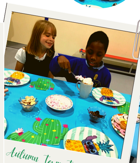
Autumn Term Tea Party